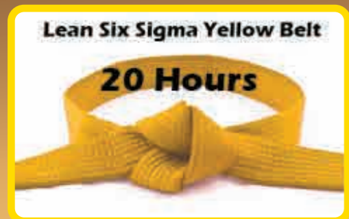
Six Sigma Practices