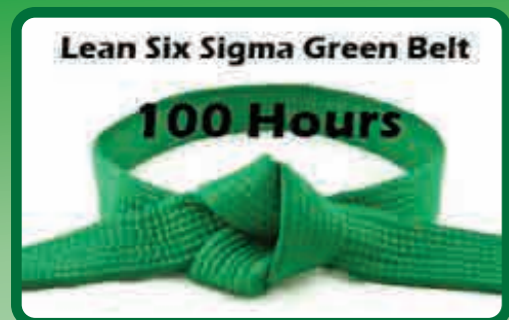
Design for Six Sigma