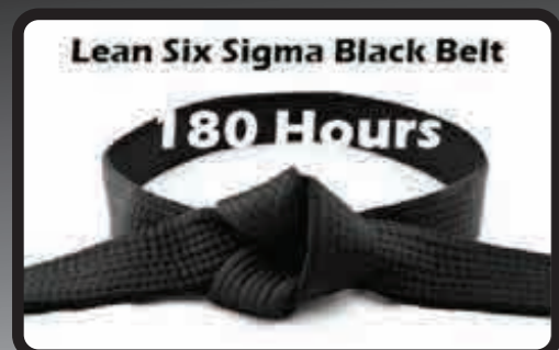
Six Sigma Statistical Analysis Using Excel and Minitab